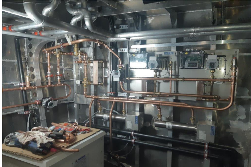
The various piping systems in the engine room.