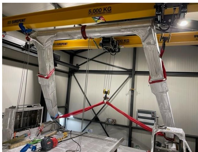
The A-frame at the stern of the RV Adriaen Coenen.

The A-frame has been temporarily installed on the working deck to make room for the foundation and the hydraulic cylinders. The definitive installation of the A-frame will wait until the last possible moment.