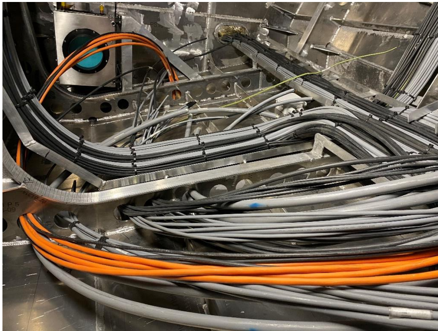
A tangle of cables in every size running everywhere throughout the RV Adriaen Coenen.

The total length of cabling aboard the vessel is approx. 7 km. That might seem like a lot for such a relatively small ship like the RV Adriaen Coenen . There are two reasons behind the total cable length of 7 km: