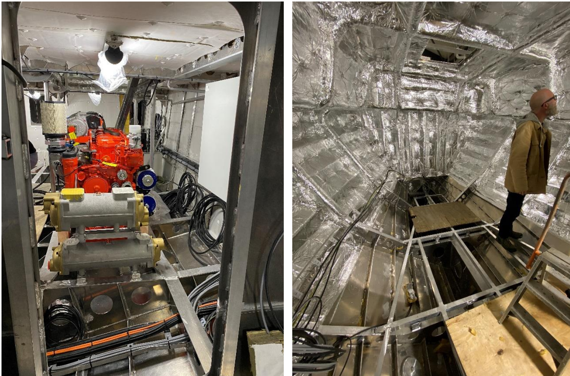
Plastic sheet insulation waiting for installation in the engine room (left), and future skipper Wimjan Boon inspecting the aluminium film insulation in the forecabin (right).

One of the guiding principles in the design was energy efficiency, and that starts with good insulation. So the hull is fitted with insulation wherever possible.