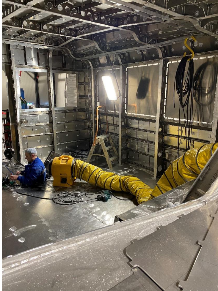
Bulkheads showing noise-insulating panels in the wheelhouse, which will be covered with a layer of thermal insulation as well.

Noise insulation is achieved by fitting small aluminium panels to the aluminium structure under the thermal insulation layer. The panels vibrate independently and interact with each other to interfere with the vibrations in the hull plating, which in turn reduces the noise level.