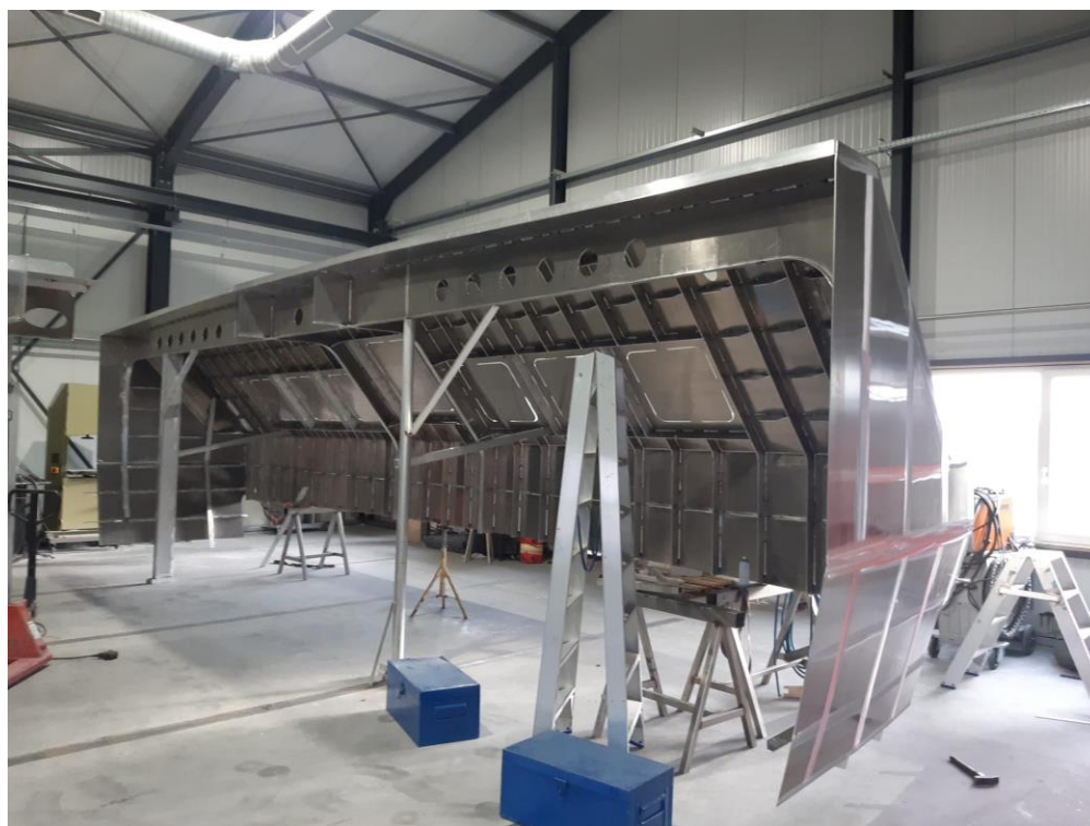
Construction of section 250 at KB Alubouw in Makkum. The porthole openings for the future mess are clearly visible

Once the sections are complete, N. Dijkstra Metaalbewerking in Harlingen will join them all together. N. Dijkstra is currently hard at work on a new expansion, where the hull will be assembled in a few months.