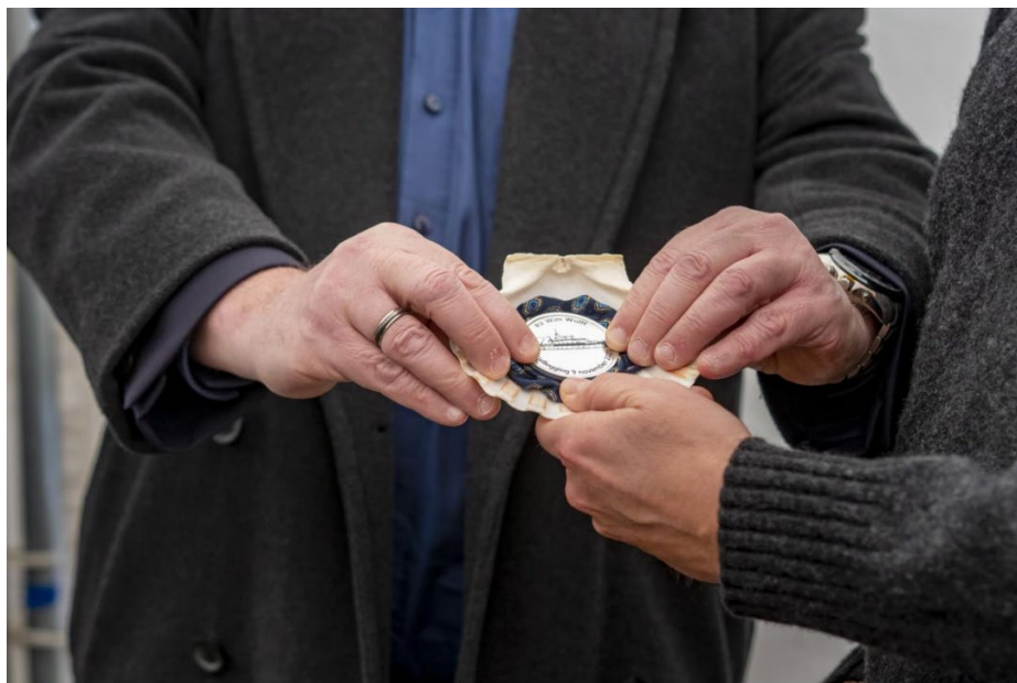
Presentation of coin used for the laying of the keel of the RV Wim Wolff.