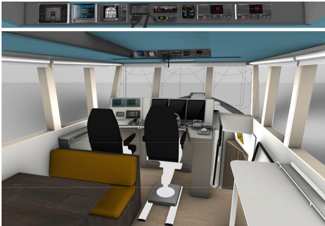
Interior of RV Adriaen Coenen wheelhouse, with view of the bridge and passenger seating (left) and dry lab (right).

The interior design is also complete, with a colour scheme that matches the other two vessels planned for construction.