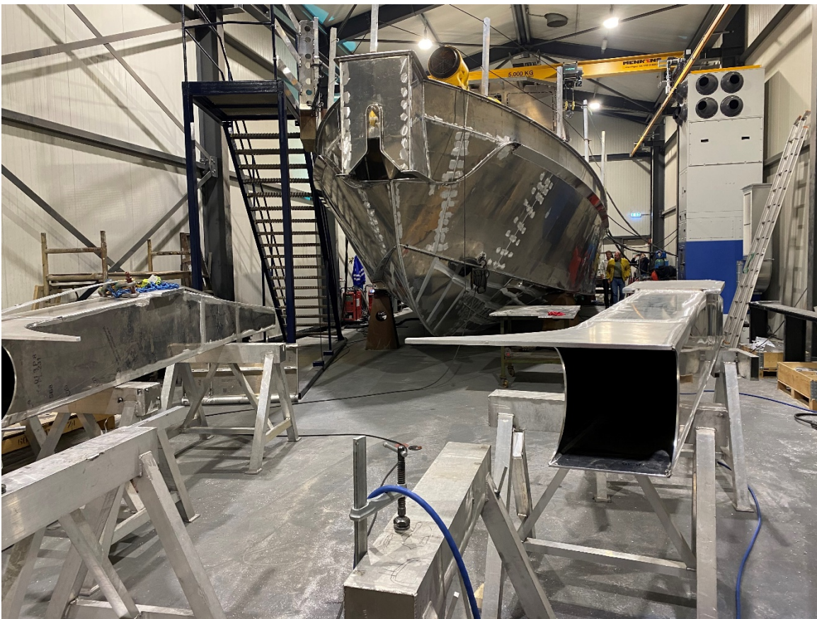
Condition in late October: the hull has just been rotated and the wheelhouse is installed. Two A-frame pillars are visible in the foreground.

The wheelhouse was then installed and welders began work on the final seams.