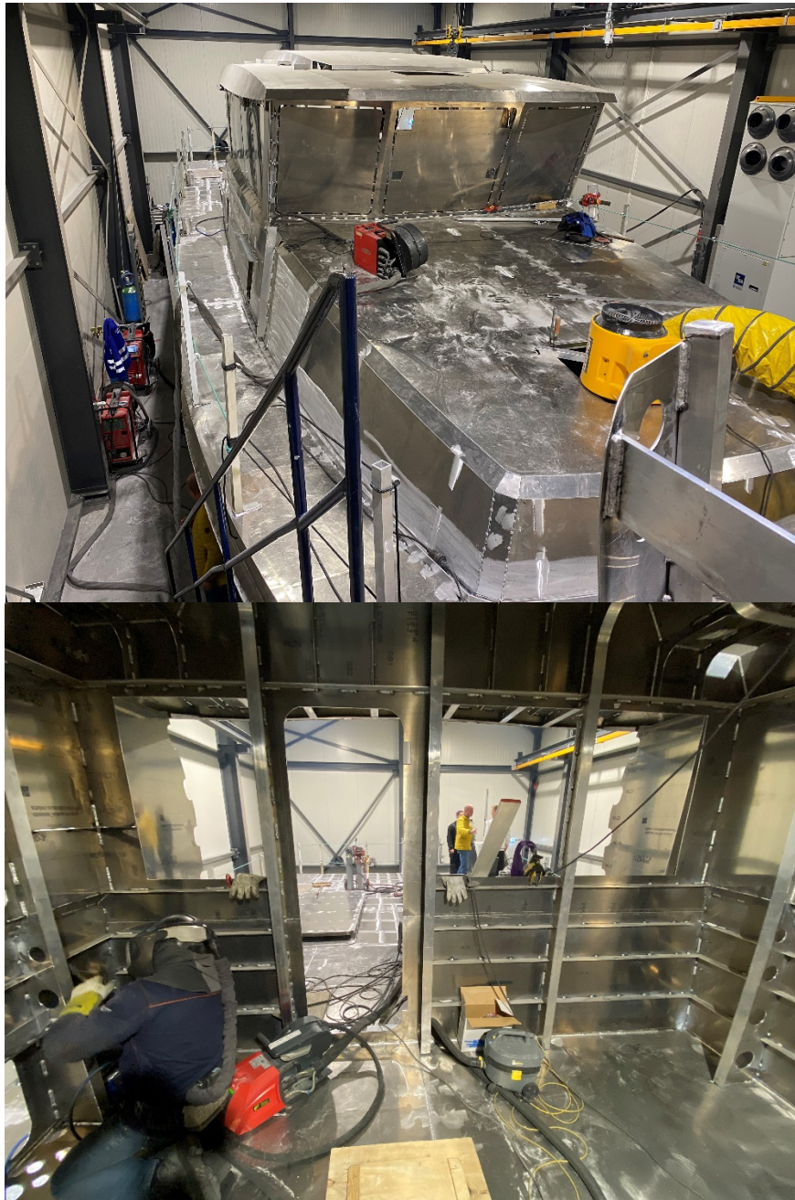
Current state of affairs in late October. Top: view of the foredeck with wheelhouse. Bottom: view of the wheelhouse on the aft deck.