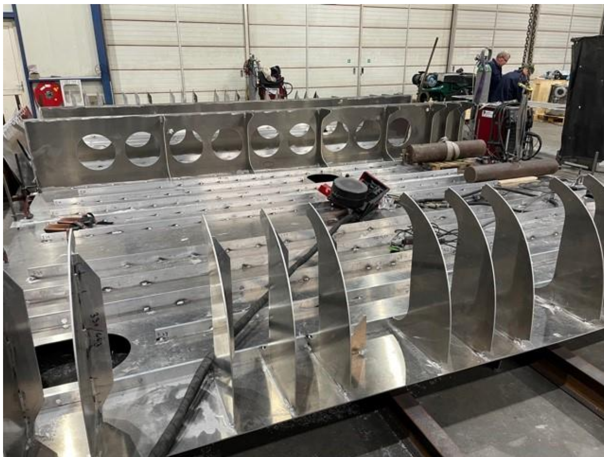
Condition in late September: the first 6-meter section begins to take shape.

The hull will be constructed in 6-meter sections, which will then be joined together. The first section had begun to take shape by late September.