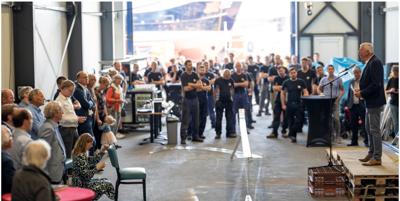
Guests for the laying of the keel of the RV Adriaen Coenen (shown in foreground) in the NGS production hall, with word of thanks by Alex Cofino.

On 8 July, Next Generation Shipyards (NGS) in Lauwersoog celebrated the laying of the keel of the RV Adriaen Coenen .