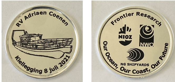
Face and reverse of the special coin used for the laying of the keel of the RV Adriaen Coenen.

To mark the laying of the keel, a special aluminium medallion was minted and welded to the keel to bring the ship good luck.