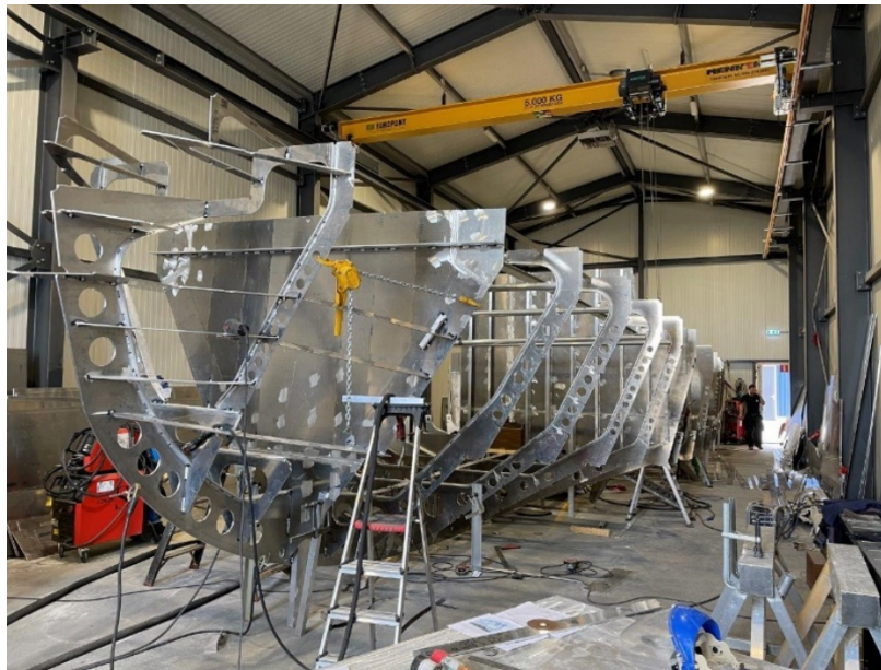
The hull of the RV Adriaen Coenen: progress by late July 2021.

The hull will be built in a secured facility by a team of around 10 shipbuilders specialised in the construction of aluminium vessels. Although construction is expected to progress slowly during the summer holidays, NGS plans on delivering the completed hull in late September. Before then, the hull will have to be rotated 180 degrees twice. The hull had clearly begun to take shape by late July.