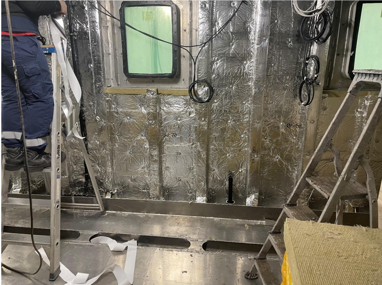
An insulated bulkhead, showing the aluminium cover film and connecting nubs.

To attach the insulation to the bulkheads, pins are first installed on the bulkheads at regular intervals. Two layers of insulation are then applied to these pins, then covered with a layer of aluminium film, tarpaulin or aluminium panels depending on the position aboard the vessel. Nubs are then attached to the pins to hold down the insulation layers.