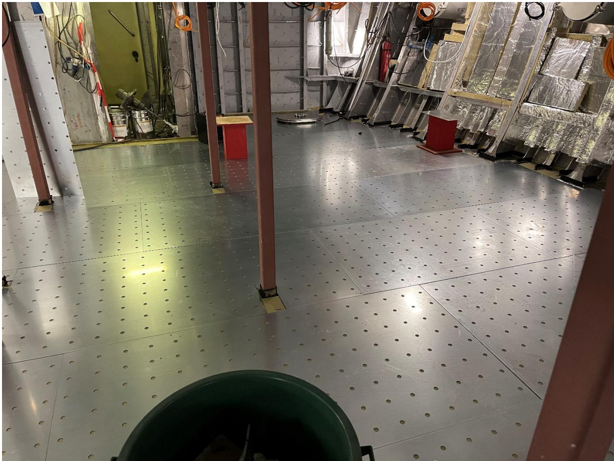
The elevated deck below decks.

To provide noise insulation, the cabins for the crew and passengers are all constructed with an elevated deck. Under the deck is a layer of compressed rock wool insulation across the entire surface, excluding the engine room. A thin sheet of steel is then installed over the insulation, and a sheet of perforated aluminium is attached to the steel using adhesive. This is necessary to create a stable floor to which the cabin bulkheads can be attached.