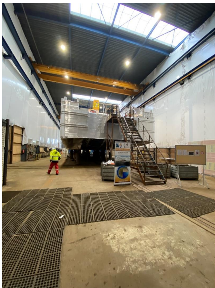
The hull when it arrived at the TSBY final construction facility. Rubber mats cover the path to the hull to prevent shoes from tracking in dirt.

In the final construction facility, builders are hard at work putting the final touches on the RV Wim Wolff . Several sub-contractors will be working on the same cabins at the same time during the finishing phase. This will require TBSY to follow a clear and detailed schedule to guide the process within the time available. And with so many different contractors working at the same time, safety is an important issue. Signs posted at the ladderway entrance remind everyone of the rules for working on board.