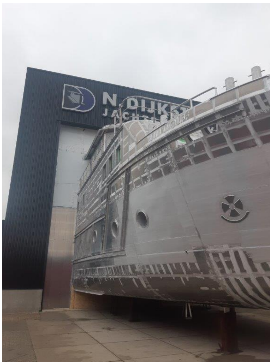
The hull extends beyond the production hall, so the door opening around the hull has been sealed off to provide optimal climate control for the work inside.