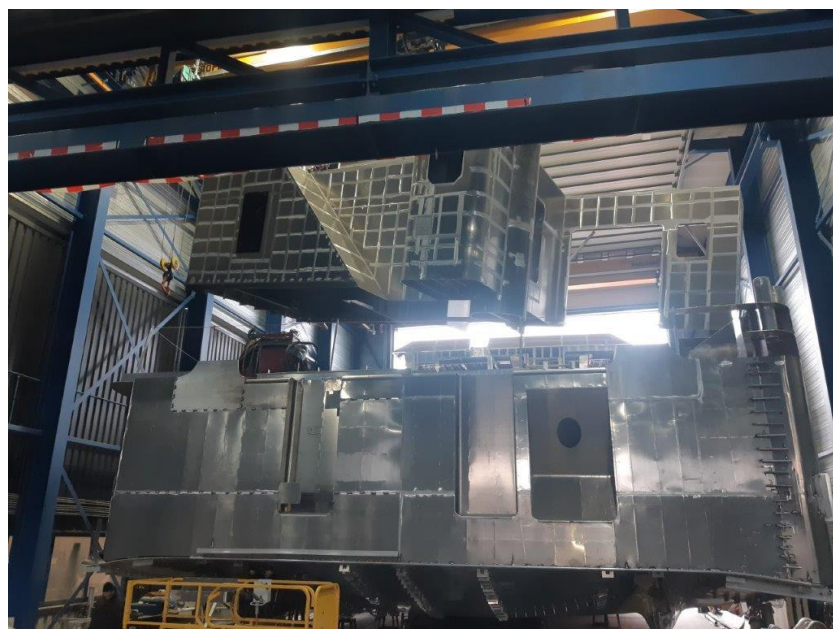
Moving the hull outside the production hall creates space for the installation and completion of the aft accommodation sections.