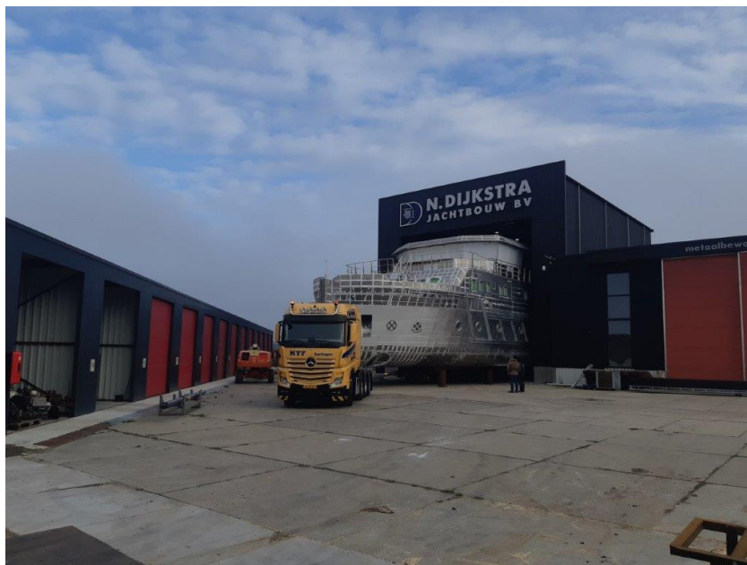
A lorry pulls the hull of the RV Wim Wolff a few meters outside the production hall at N. Dijkstra.