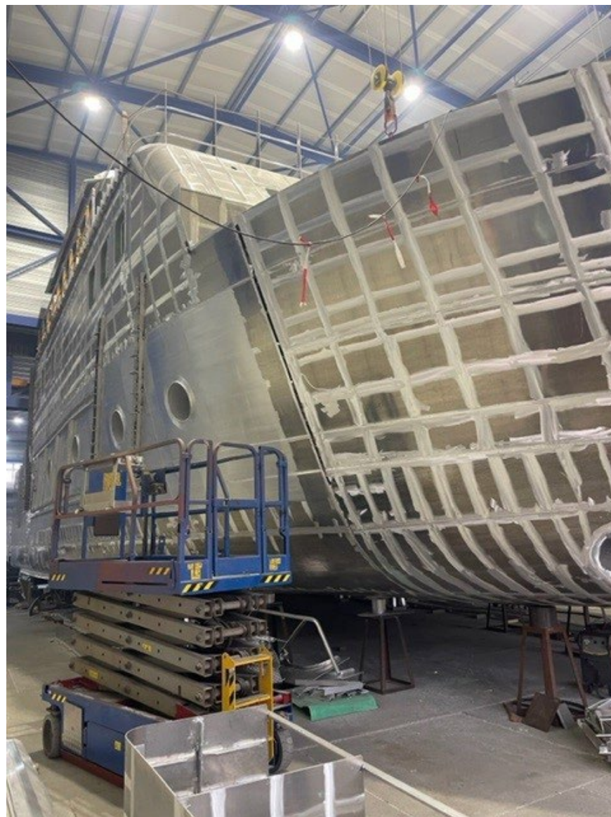
Bow section 510 has been joined to the hull.

The construction of the hull was interrupted for three weeks due to the summer holidays.