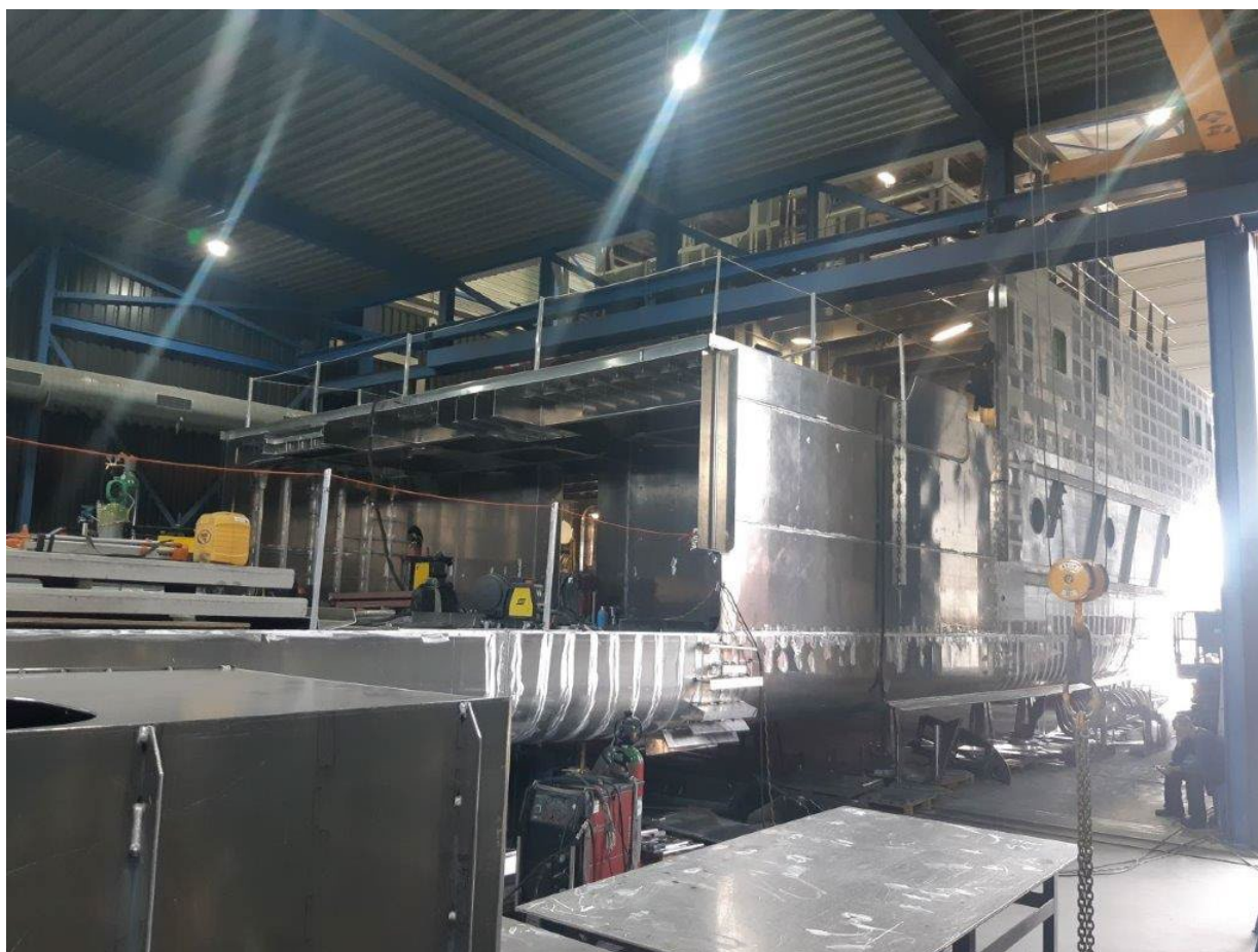
The hull of the RV Wim Wolff has been extended with section 310 and raised with section 270.