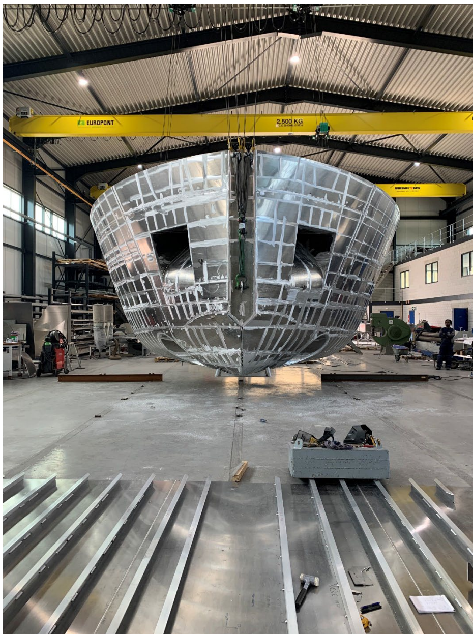
Rotated bow section 510, ready to be joined with the rest of the hull. The anchor ports are clearly visible.