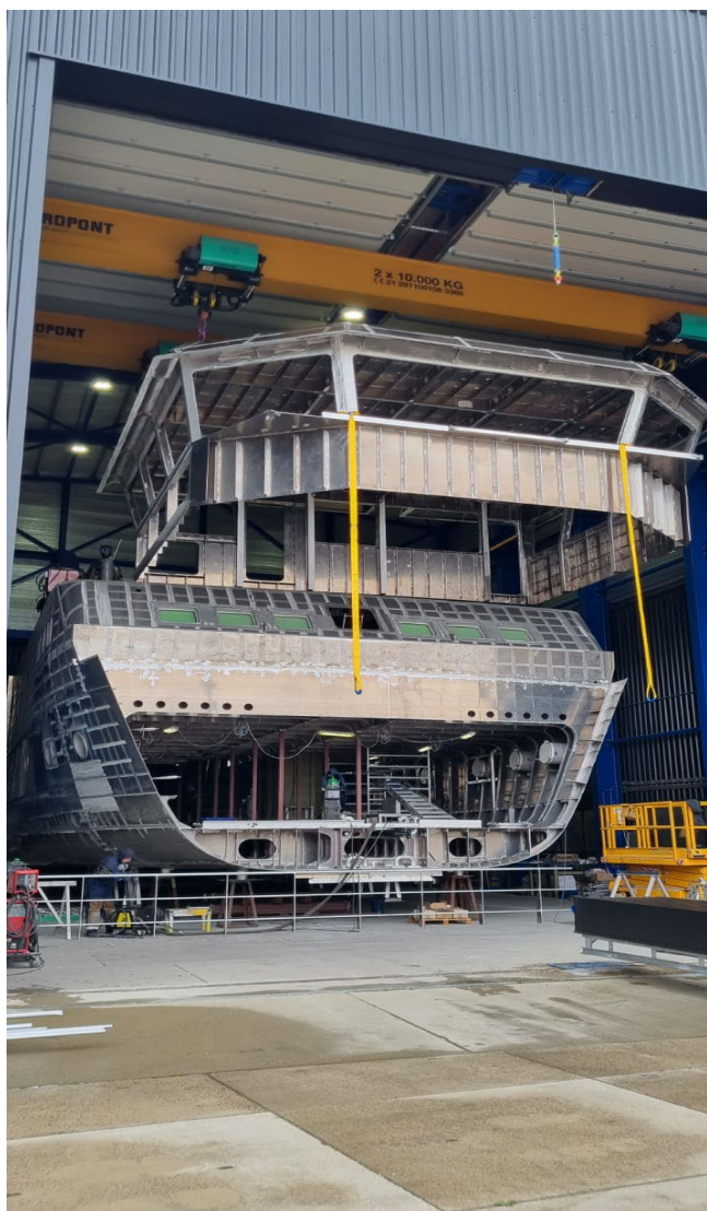
The wheelhouse installed on the hull of the RV Wim Wolff at Dijkstra in Harlingen.

The wheelhouse manufactured by Alubouw Friesland was recently installed and welded to the hull at Dijkstra. This required great precision due to the limited free height above the hull in the workshop.