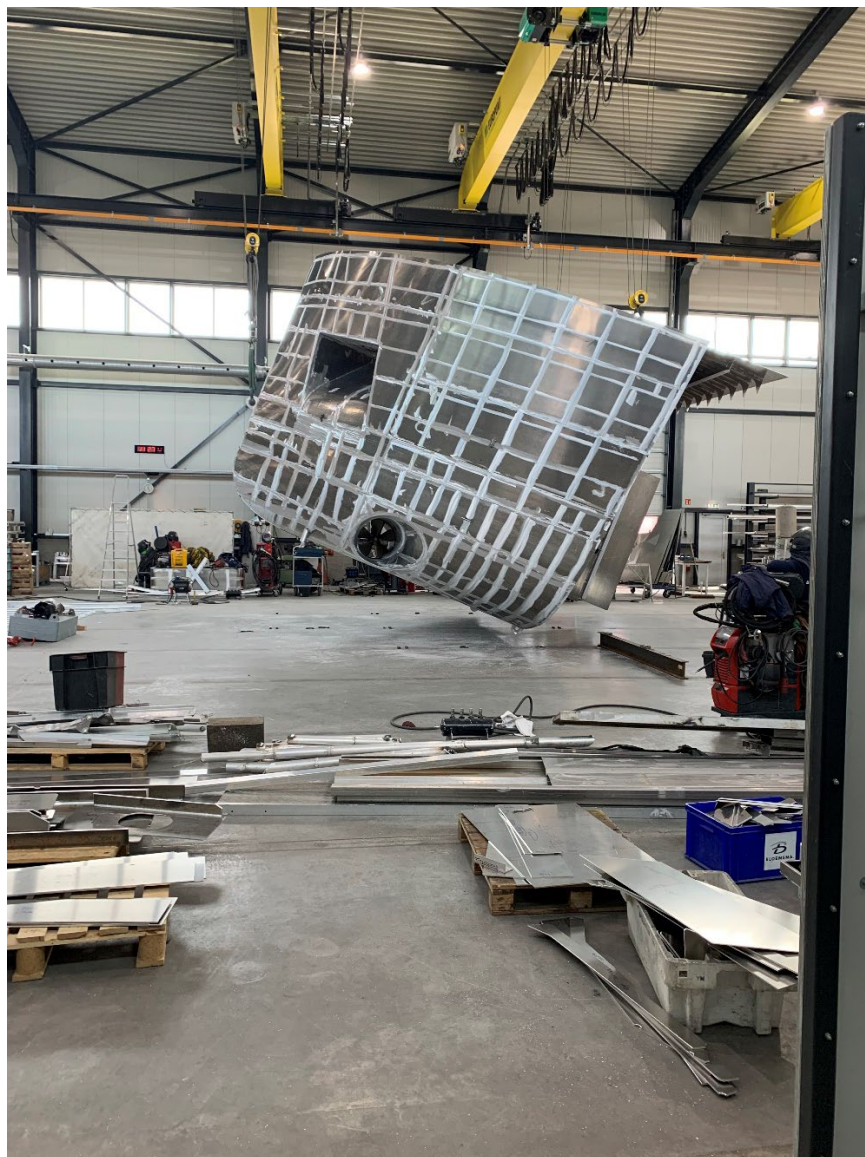
Bow section 510 being turned right-side-up.

The hull sections are built upside-down and reversed, then welders attach them together after the hull plating is applied. Last month, Bloemsma shipbuilders in Makkum completed construction on bow section 510, so it is now right-side-up and ready for joining with the rest of the hull.