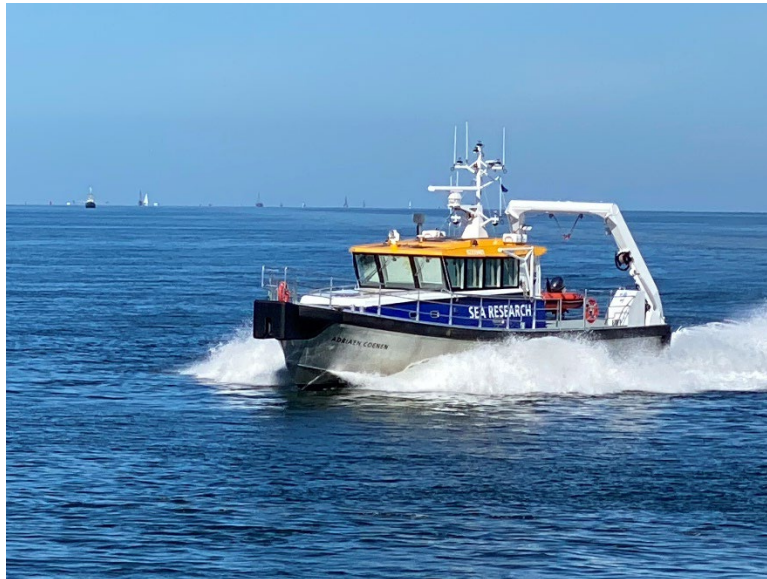
Arrival of the RV Adriaen Coenen at Texel.