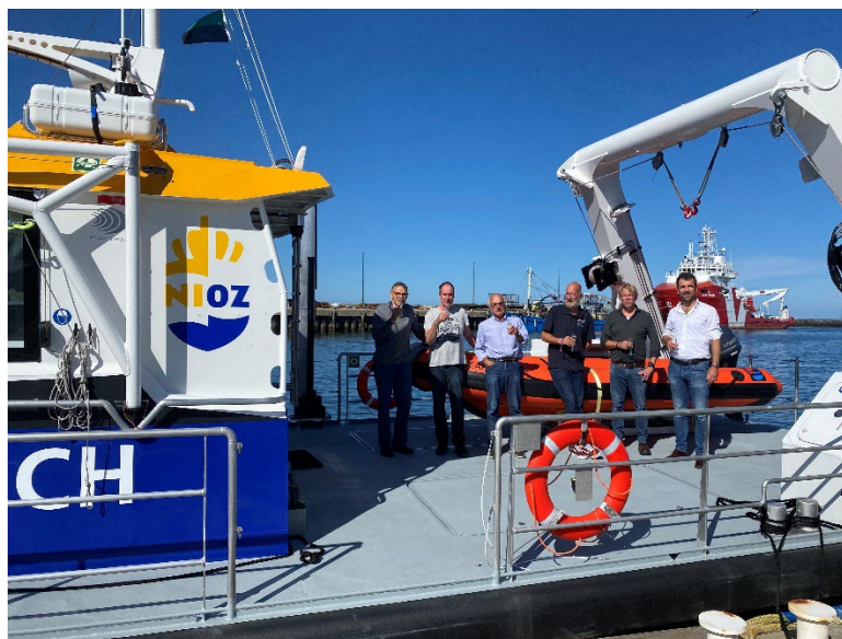
Those in attendance raised a glass to the successful completion of the new construction process.

For more information, please visit: www.NewResearchFleet.nl .