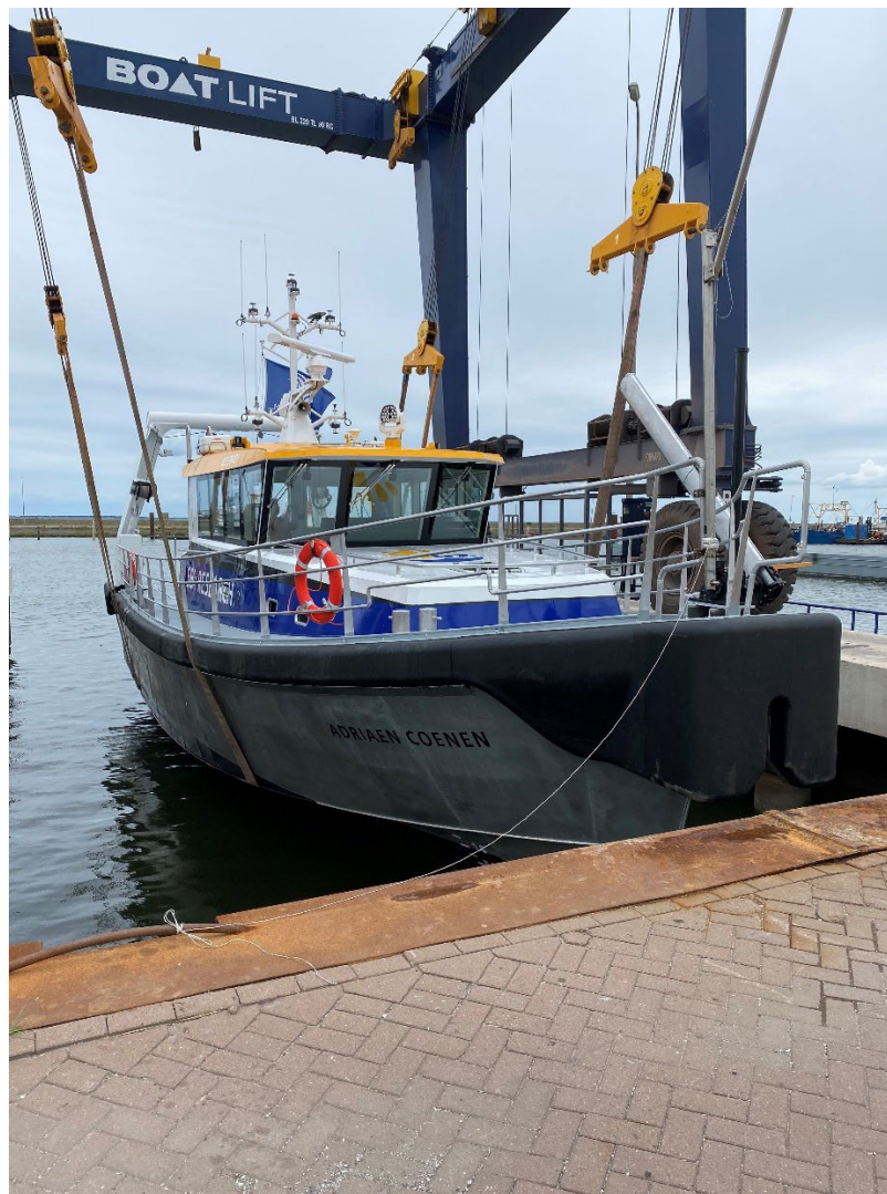
The RV Adriaen Coenen in the tackle lift, awaiting the christening ceremony.