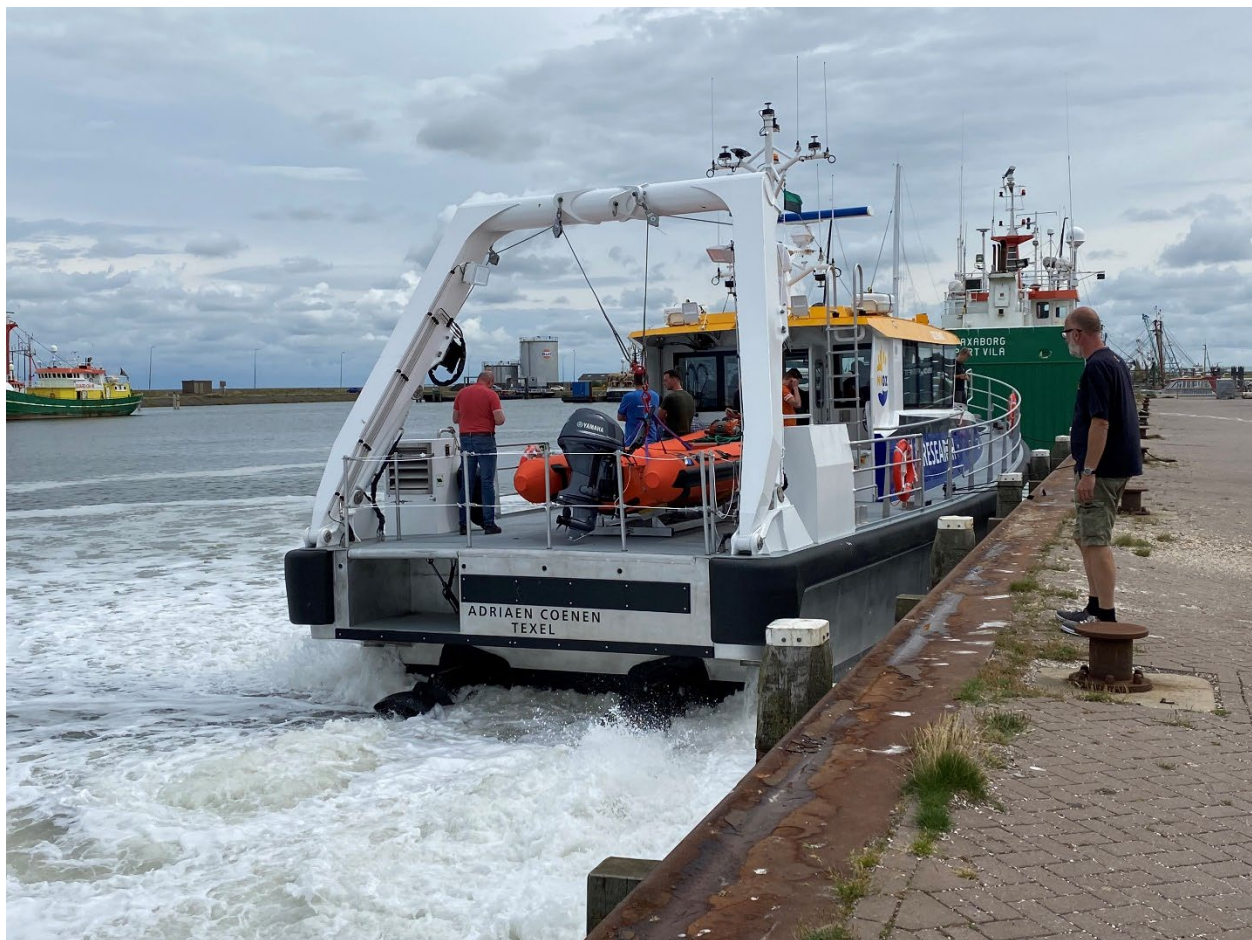
The RV Adriaen Coenen in the harbour of Lauwersoog, awaiting a shakedown cruise.

The christening followed a period in which all of the systems on board were inspected and tested in the presence of representatives of the client NIOZ. Several shakedown cruises are scheduled to be conducted before the vessel is handed over to the NIOZ. This time will also be used to complete the final details and make minor adjustments.