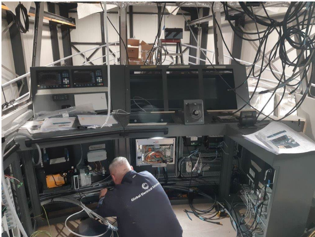
The wheelhouse console remains a nest of open wiring until the very end.

All of the operating controls come together in the wheelhouse console. This is where the wiring for the technical installations is joined to the controls. The workers have been working overtime to get everything finished on time.