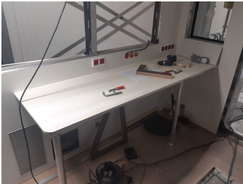
The carpentry seating (top) and dry lab (bottom) in the wheelhouse.