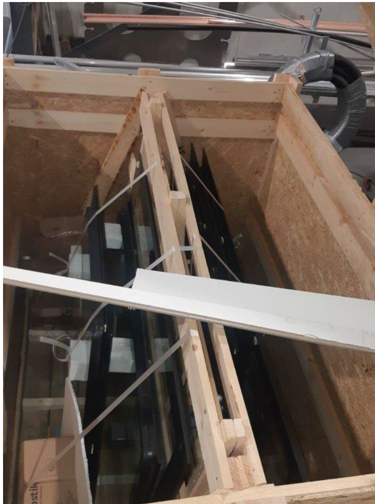
The crate with the eagerly awaited portholes.

The portholes were manufactured in Turkey, and although there was some concern as to whether they would be delivered in time, they have since been received and installed.