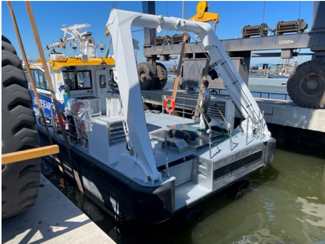
RV Adriaen Coenen finally in the water on 22 June 2022.

For more information, please visit: www.NewResearchFleet.nl .